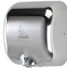
SS HAND DRYERS