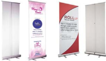
PULL UP STANDEE 3X6