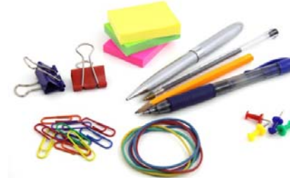
BINDER CLIPS AND MORE...