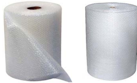
AIR BUBBLE ROLLS