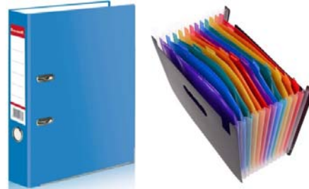
FILES & FOLDERS