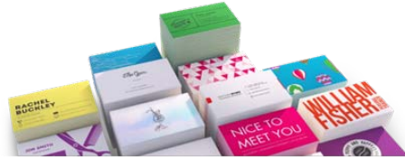
BUSINESS CARD PRINTING