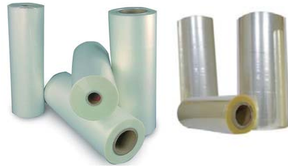
LAMINATION ROLL FILM