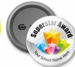
BUTTON BADGE PRINTING