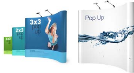
POPUP DISPLAY SYSTEM