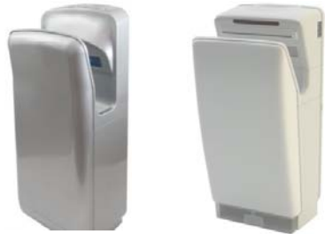
JET HAND DRYERS