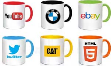
COFFEE MUGS PRINTING