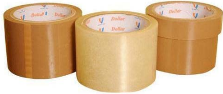
BOX STRAPPING TAPE