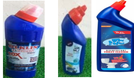
TOILET BOWL CLEANER