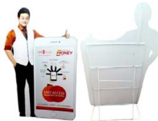
CUT OUT DISPLAY STAND