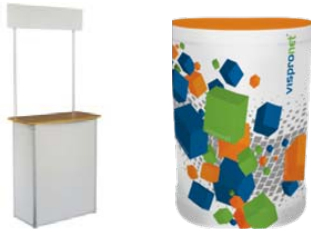
HARDCASE PROMOTION COUNTER