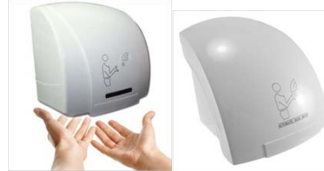
ABS HAND DRYERS