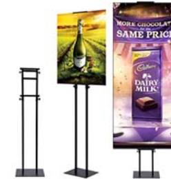
PEDESTAL POSTER STAND