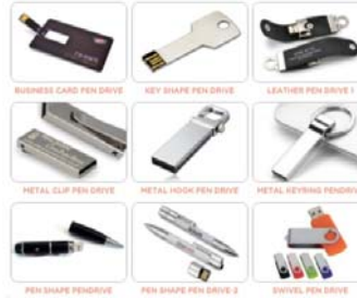
PEN DRIVE PRINTING