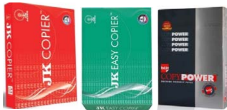
COPIER PAPER-70GSM, 75GSM, 100GSM