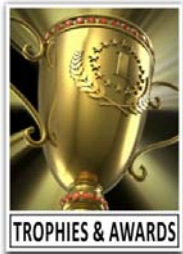
TROPHIES & AWARDS